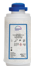
Leonsorb plus Art.Nr.: 0209410/6