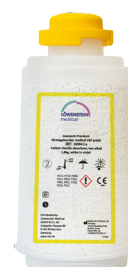
Leonsorb premium Art.Nr.: 0209411/6